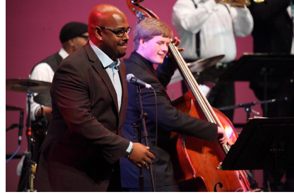
Grammy Award winning bassist Christian McBride

Many of our students choose to take summer school in order to fit in all the amazing electives New Trier offers. Read the article Summer School Succeeds from the May 7, 2015 edition of New Trier's sophomore student newspaper, "The Journal" to discover why so many New Trier students take advantage of this opportunity.