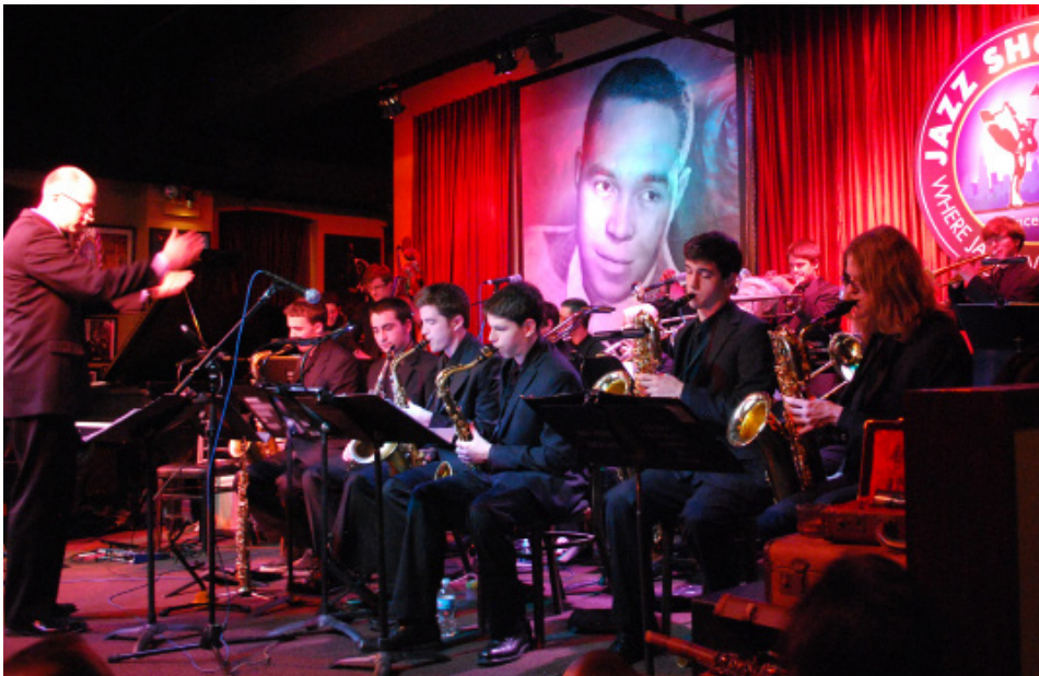
Jazz Ensemble 1 performing at The Jazz Showcase in Chicago