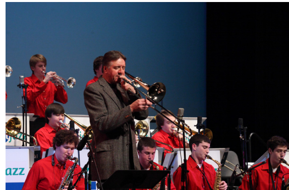
Renowned trombonist Conrad Herwig performs with Lab Jazz Ensemble